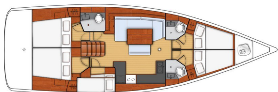
5 cabins - 3 heads