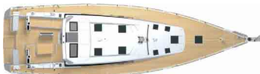
3 cabins - 3 head compartments