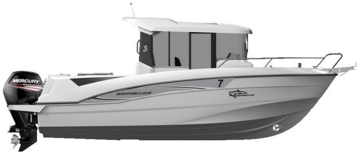
3 door version: